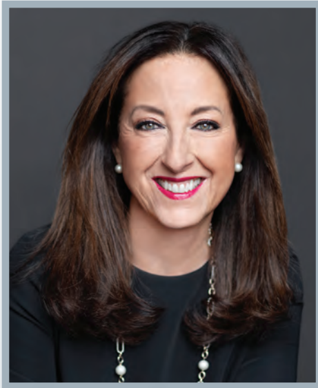
Beauty care: Véronique Prud'homme